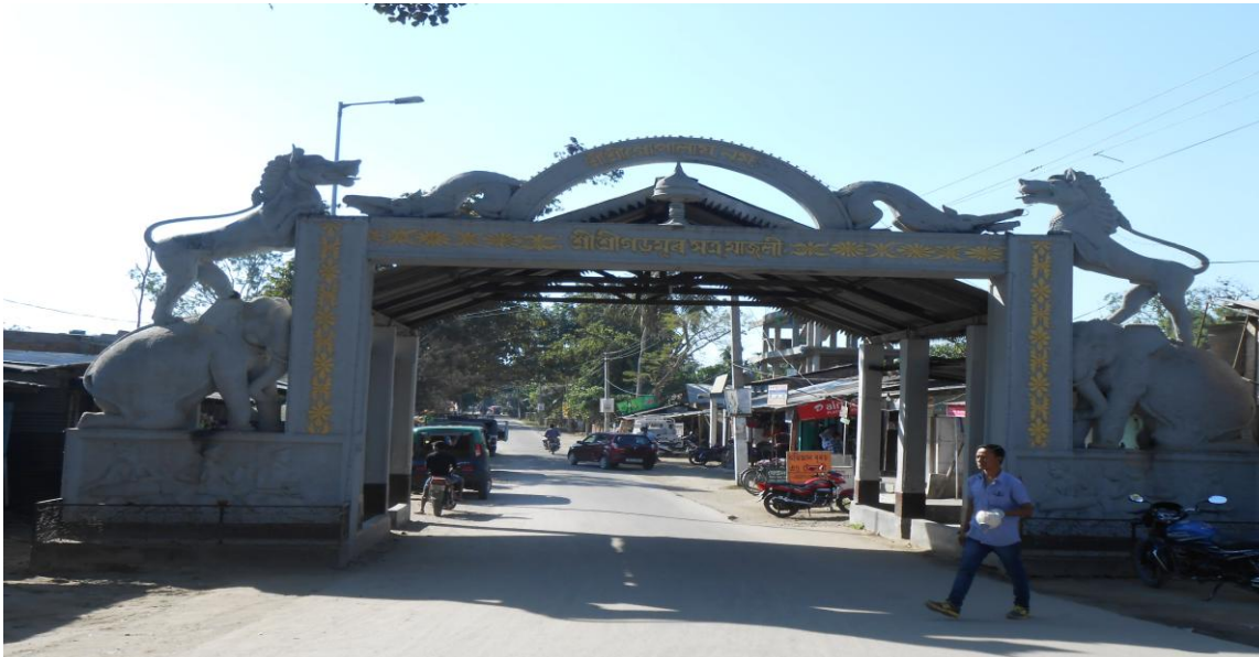
Garmur Satra Entrance