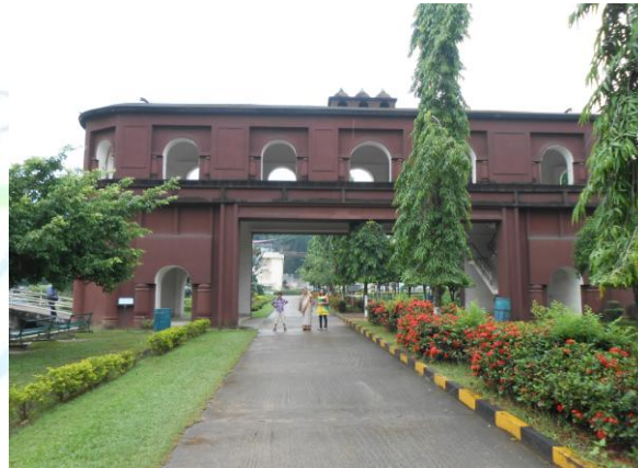
Sankardev Kala Khestra