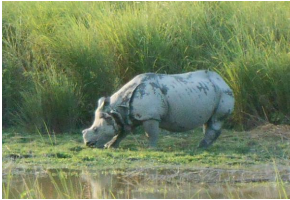
Rhino in KNP