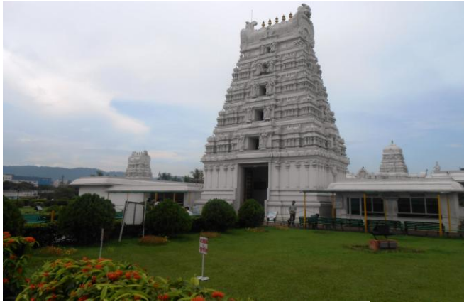
Tirupati Ballaji Temple, GHY.